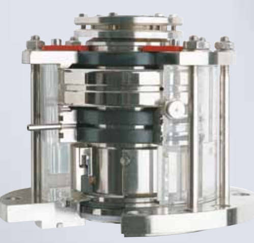
The EagleBurgmann M481KL-D20 for top driven steel tanks acc. to DIN can be equipped with an polimerization barrier.

It has performed very effectively in practice in this way. In most cases, the design takes the form of a concentric labyrinth.